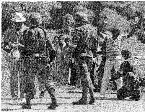
U.S. soldiers searching Panamanians.